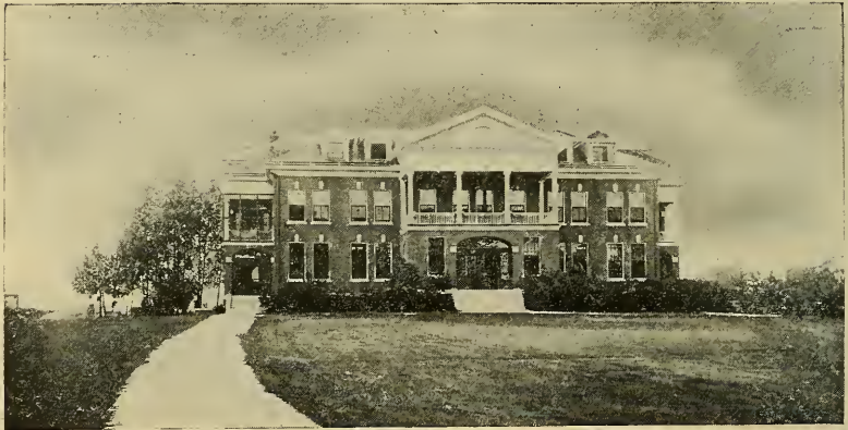
THE DINING HALL

Besides these, general field exercises will be arranged for one afternoon of each week. These will be on topics of interest to all. Excursions will be arranged for every Wednesday afternoon, and more extended excursions for the whole school will be planned for every Saturday. The excursions